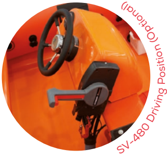
SV-480 Driving Position (Optional)

In full compliance with S.O.L.A.S.requirements, they has been designed to place the approved stretcher on deck, which is a compulsory require-ment, to carry an injured person. On top of that the rescue boat has transverse seats for all the passengers and a bow locker to store all the necessary equipment. Rescue boat with high capacity and performance, allowing a quicker and more effective answer when facing an emergency situation. The SV-480 lay out have been designed and approved in order to allow navigation by using an adapted driving position, as well as navigation with traditional out-board engine with tiller.